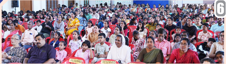
The audience at a glance!