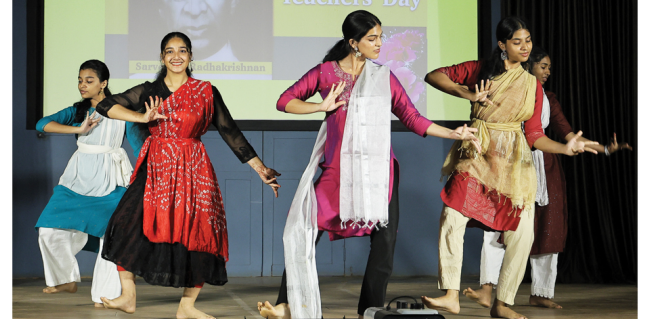
Semi-classical Dance by Class XII Science girls