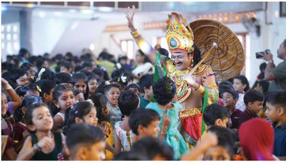
Mahabali's blessing to the children

On the 2nd of September, the students of Hari Sri enjoyed the well-crafted Onam celebration planned by the parents and teachers. The programmes set up on stage comprised of various activities; a classical dance that reflected our culturally rich Kerala, a symphonious Thiruvathirakkali, a stylish cinematic dance and a medley of age-old as well as presently trending songs. The set of events culminated with a ramp walk that blended evergreen fashion with modern acquisitions that left the audience awe-struck. The anchors, too, did a wonderful job in hooking the audience and serving as the much-needed bridge between the performers and the spectators. The guest appearance of Mahabali, too, is worth mentioning. After an energetic and impromptu dance session, students took to exploring the stalls that had been set up for us; various food as well as game stalls which quelled both our grumbling stomachs and our zealous minds. Following this, there was a spectacular tug-of-war, more popularly known as Vadamvali, inclusive of parents, teachers and students.