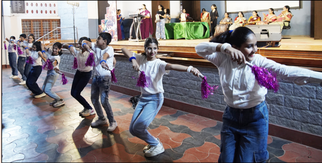
Cheer girls entertaining the audience