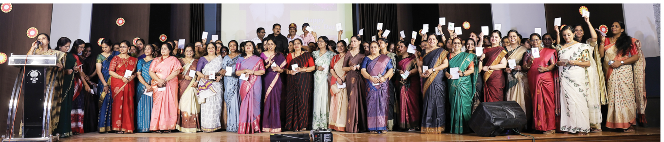
Captains of 2024-'25 giving Teachers' Day cards to all the teachers