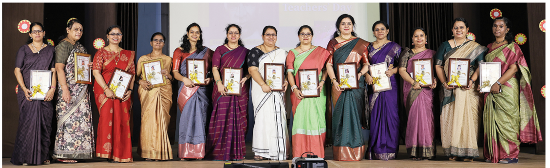
Teachers who were honoured for all their years of service in school