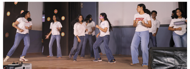
Cinematic Dance: XII Commerce