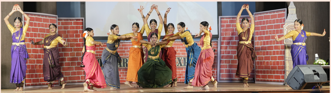
The Opening Dance performed by the Plus One students