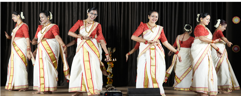
Kaikottikali- Uniting grace, music and heritage