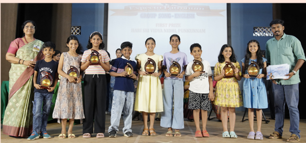
Light Music (Western)