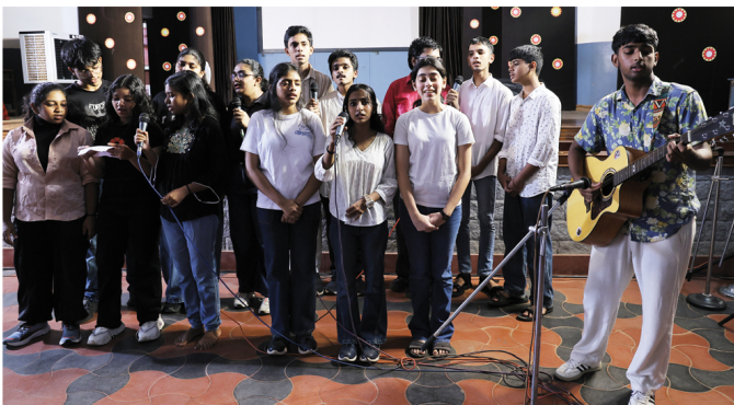
Group song by Class XII students