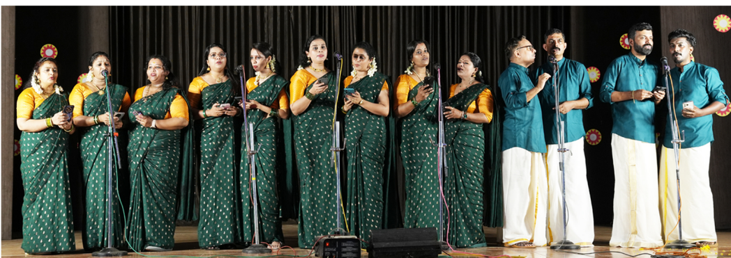
One rhythm, many voices - Group song