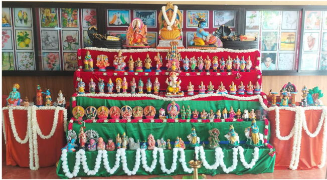
The Craft teachers arranged a bommakolu in connection with the Navarathri Celebrations