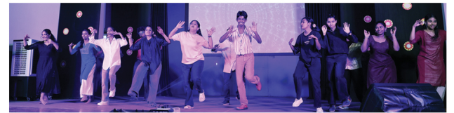
Cinematic Dance: XII Science