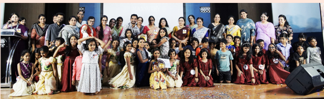
First Runner-up: Don Bosco School, Mannuthy, Category 3 (Zone-E)