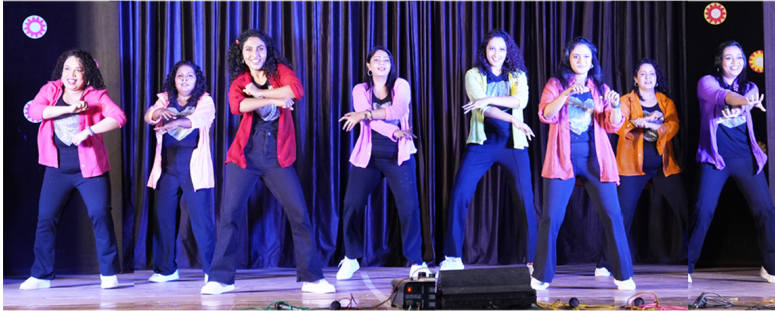
Cinematic dance performance