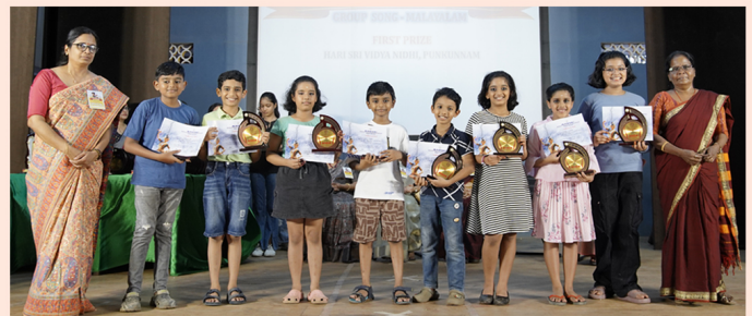
Light Music (Eastern)