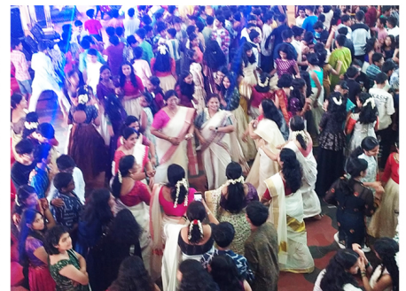
Celebrating with dance steps - teachers and students