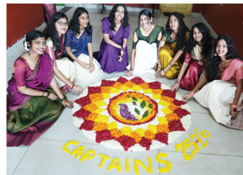
Pookkalam done by the Captains