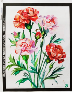
Asna Hassim, XC