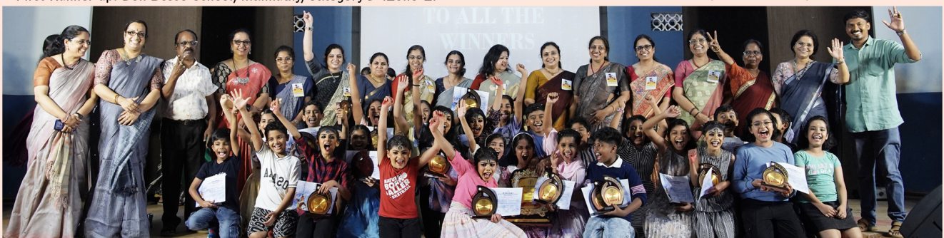
Hari Sri Vidya Nidhi School secured the Overall Championship in Category 3 (Zone-E) Cultural Fest