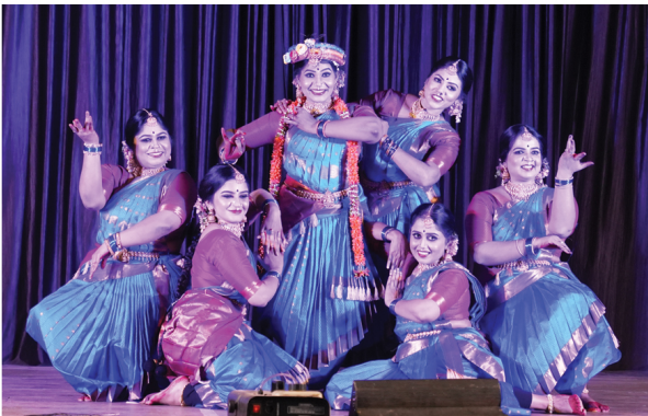
'Ranga Pooja' - a blessed beginning