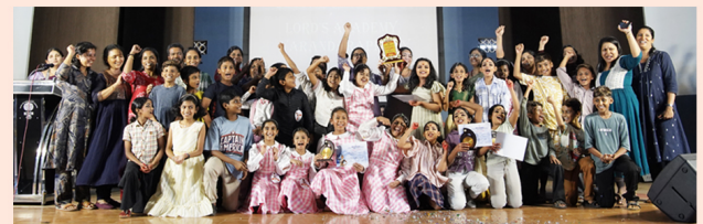
Second Runner-up: Lord's Academy, Varandarapilly, Category 3 (Zone-E)