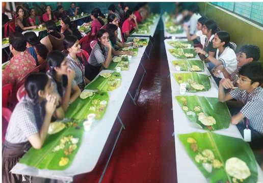
'Onam Sadya Vibe'