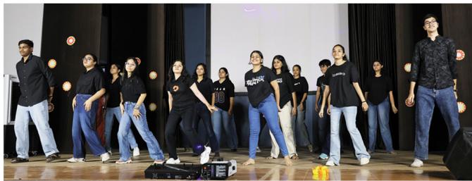
Cinematic Dance performance by Class XII Humanities