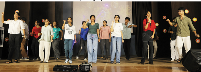
Cinematic Dance: XI Captains