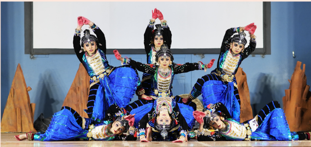
Group Dance performance