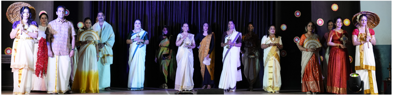
Ramp Walk-Fashion Show-Modern Vibes. Traditional Roots